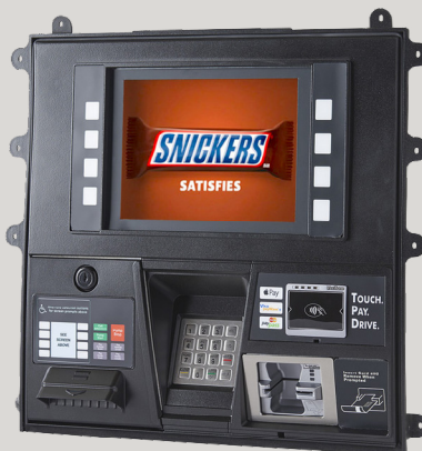
FlexPay™ Retrofit Kit

Retrofit Kit purchases made by August 31, 2020, and installed by December 31, 2020, qualify for a CHS Technology Rebate of $1,500 per dispenser, up to $6,000 per Cenex branded location. Equipment must be purchased through and installed by an authorized Gilbarco equipment distributor.