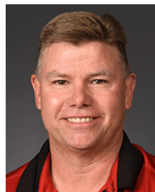
Lives in Eau Claire, WI