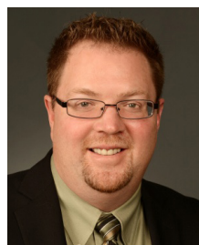
Lives in Mandan, ND

Target Corporation Store Manager and Director of Store and Executive Team Training in MN and WI