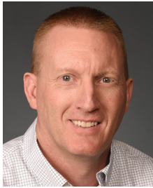
Lives in Omaha, NE

CHS Retail Specialists know the convenience store business inside and out, and are here to work side by side with you. By bringing up to the minute expertise and proven ideas to your door, they will help you succeed in this industry.