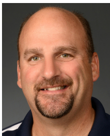
Lives in Fargo, ND

SuperAmerica and Circle K District Manager/Manager Trainer PDQ Food/Convenience Stores District Supervisor