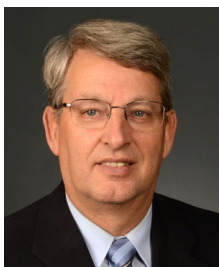
Lives in Sioux Falls, SD

Erickson Oil Products, Inc District Manager Speedway SuperAmerica LLC District Manager Family Express Marketing Representative